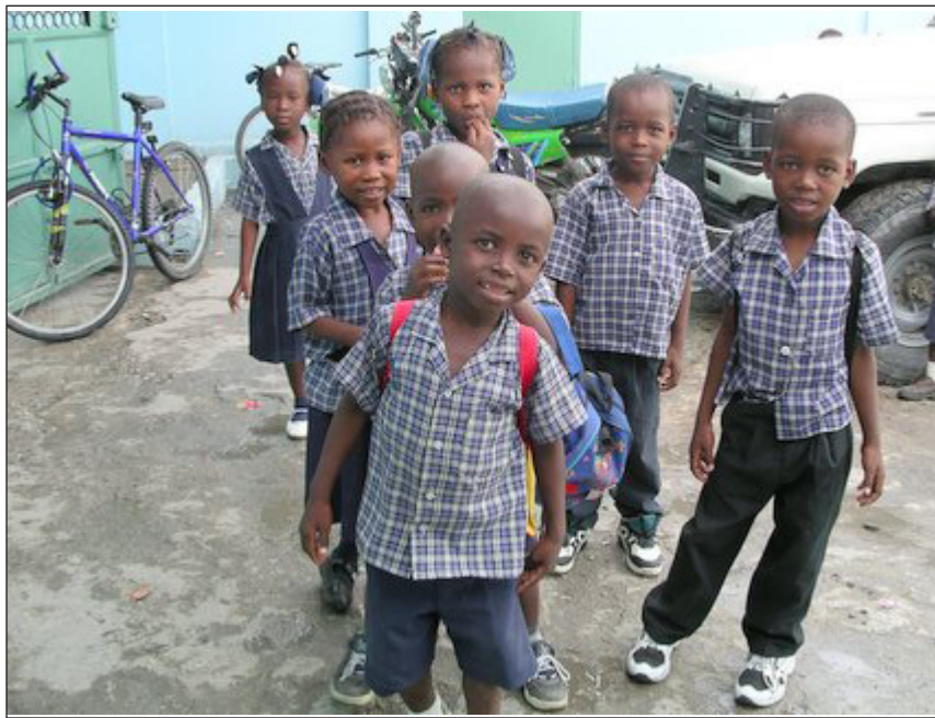
REPRESENTATIVES from Council 9487 will visit Haitian children March 15.